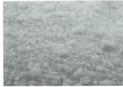
Condat produces a range of borax-free lubricants

Condat prioritises the monitoring of substances used and the improvement of the formulation of these products. The company has expanded its range of borax-free wire drawing lubricants over the years to meet the most demanding applications. Its borax-free surface coat-