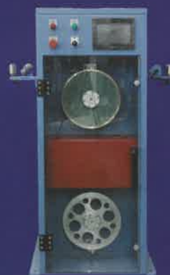
Electrostatic Talc Coating Machine EPS-1