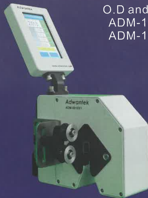
O.D and Lump Measurement ADM-10XY/T, 25XY/T, 50XY/T ADM-100XY/T, 200XY/T