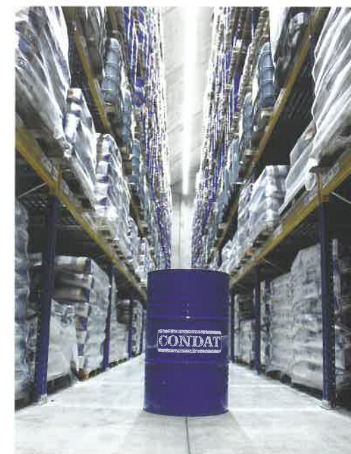
Condat has again been certified platinum by EcoVadis

With the climate challenges, Condat's objective is to encourage social and