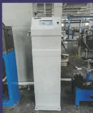
Wall-thickness Measurement ACM-10XY, 25XY, 50XY